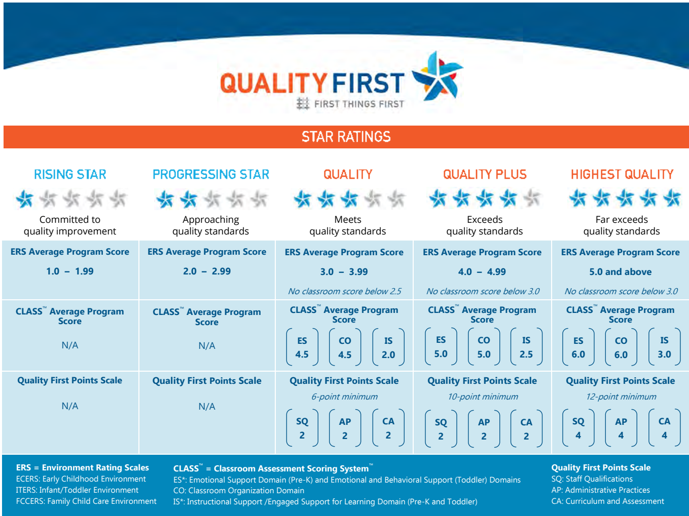
Exhibit 1. Quality First process for determining star ratings

Exhibit 1 below shows how the scores from these three instruments are combined to assign a star rating at each of the five levels.